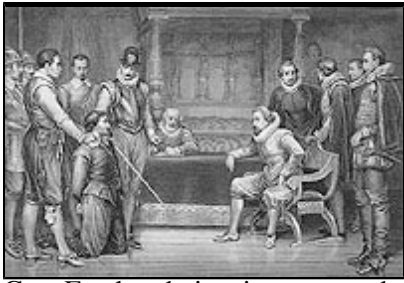
Guy Fawkes being interrogated by King James VI of Scotland and I of England

Not for long, however. By December, only Robert Wintour was still free. Furthermore, under interrogation Bates had admitted confessing the details of the plot to the Jesuit priest Father Tesimond. With the Jesuits now implicated in the 'Powder Treason', the government set about finding them, ransacking scores of Catholic homes in the process.